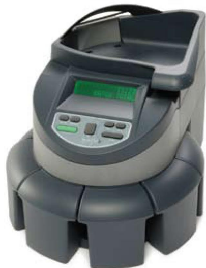
Mach 3 pictured with large capacity "mega" coin drawers

The Mach 3 is a versatile, cost efficient, compact coin processor that simplifies and speeds coin processing for any business that counts, sorts, or packages coin.