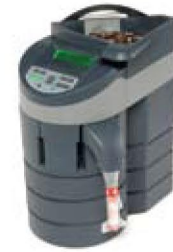
(Coin tubing option)