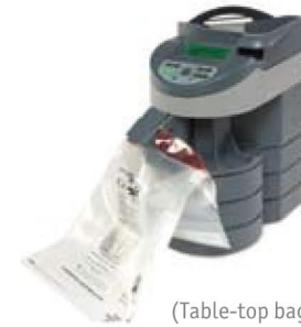
(Table-top bagging configuration)